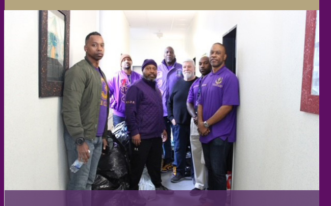
Homeless shelter donation pgg 13 January 2024

The Brothers Of PGG Chapter Support the Saint Christophorus Homeless Shelter in Kaiserslautern