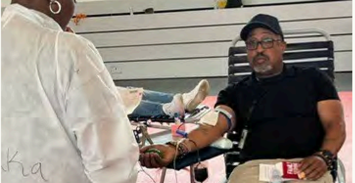
Health Initiative Phi Gamma Gamma (Germany)