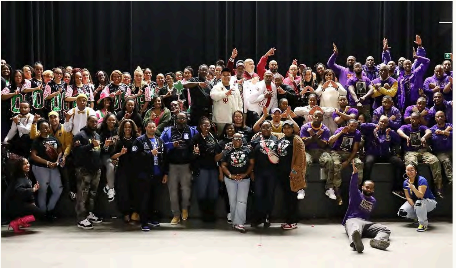
Step show participants: Divine nine organizations in attendance